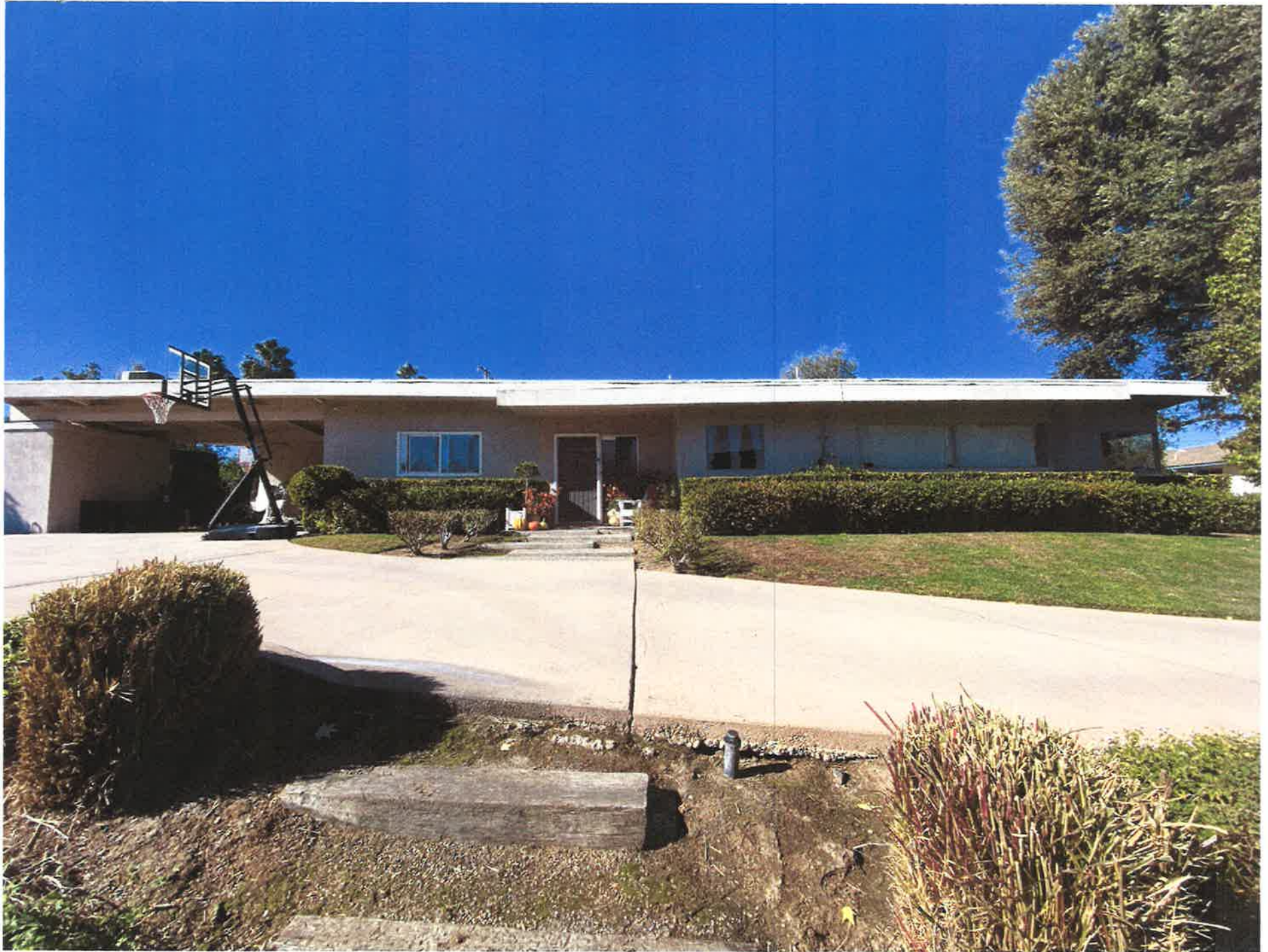
FRONT OF RESIDENCE TO BE DEMOLISHED