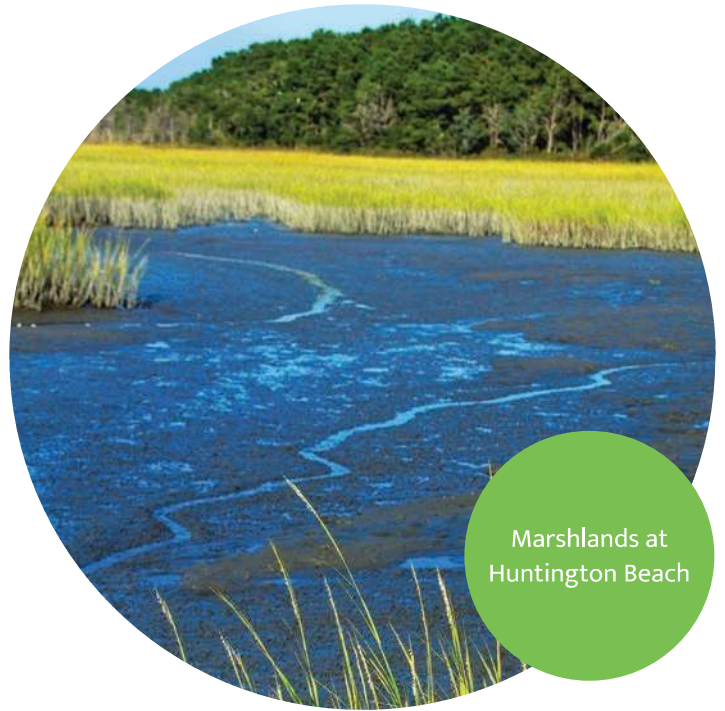
Marshlands at Huntington Beach

Over the past two years, the Commission has seen an uptick in applications from landowners seeking to improve the boundary for their property. One application filed with OC LAFCO during the current fiscal year includes a landowner petition to realign a property that is currently split between the County of Orange and City of Tustin.