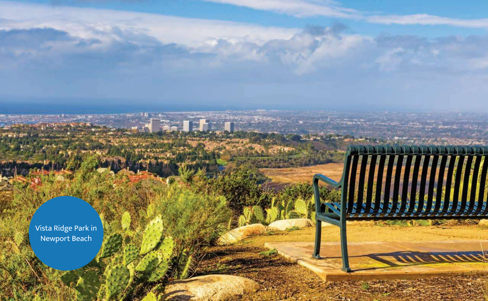
Vista Ridge Park in Newport Beach